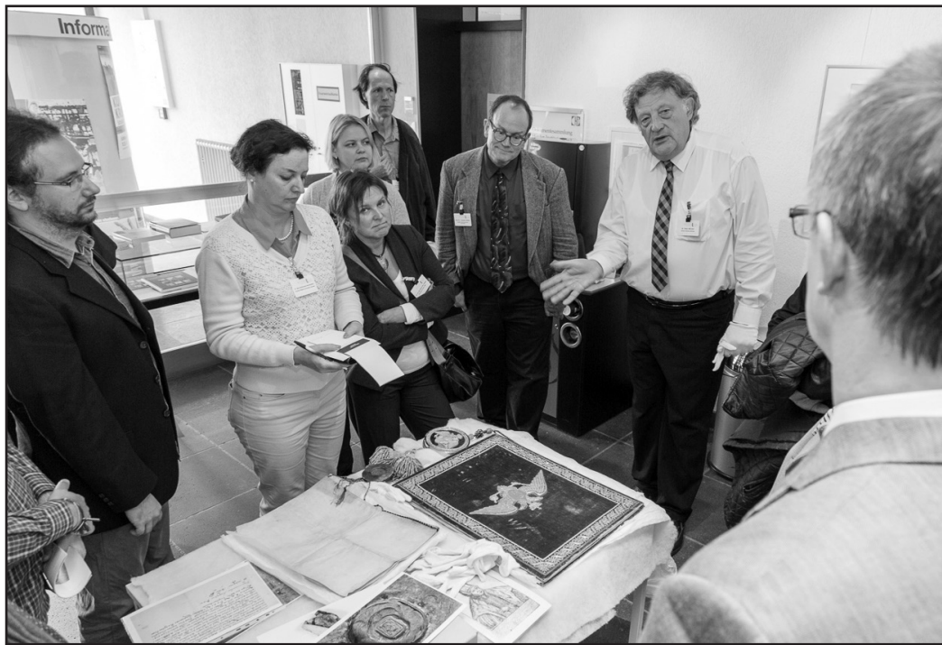
Attendees at the 2015 Conference on Baltic Studies in Europe (CBSE) in Marburg, Germany.

aabs@uw.edu http://depts.washington.edu/aabs/ @balticstudies