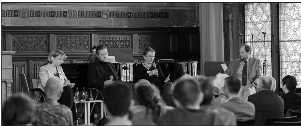
Panelists discuss "Rethinking Europe in the Crisis: The Baltics and Eastern Europe in Transition" at the closing event of the CBSE hosted in the Alte Universität of Marburg University.