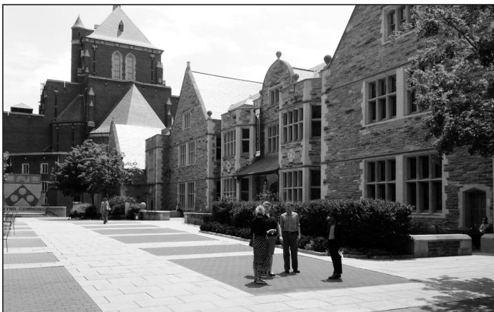
U Penn will host the 2016 AABS Conference.