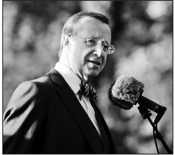
Estonian President Thomas Hendrik Ilves will give the keynote speech at the AABS 2016 Conference at U Penn in May.