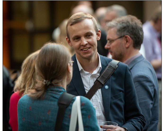
Top: Conference attendees relax at the Meyer Green Lawn during a reception and performance, "An Open-Air Celebration of Baltic Culture," June 2, 2018. | Keith Uyeda