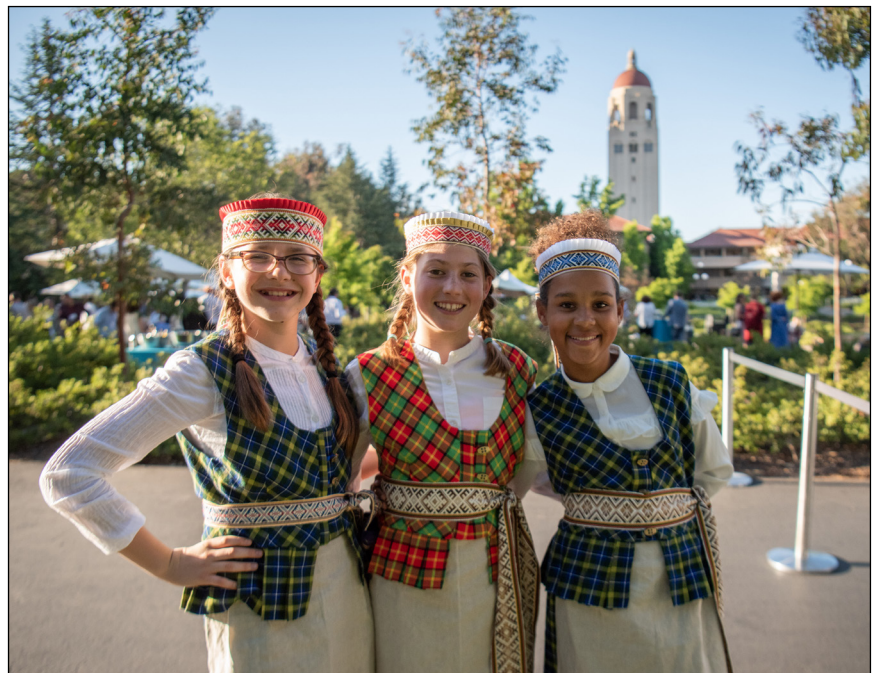
Bottom: Lithuanian dancers from "Genys" group pose for a photo. The group performed during the Conference reception.