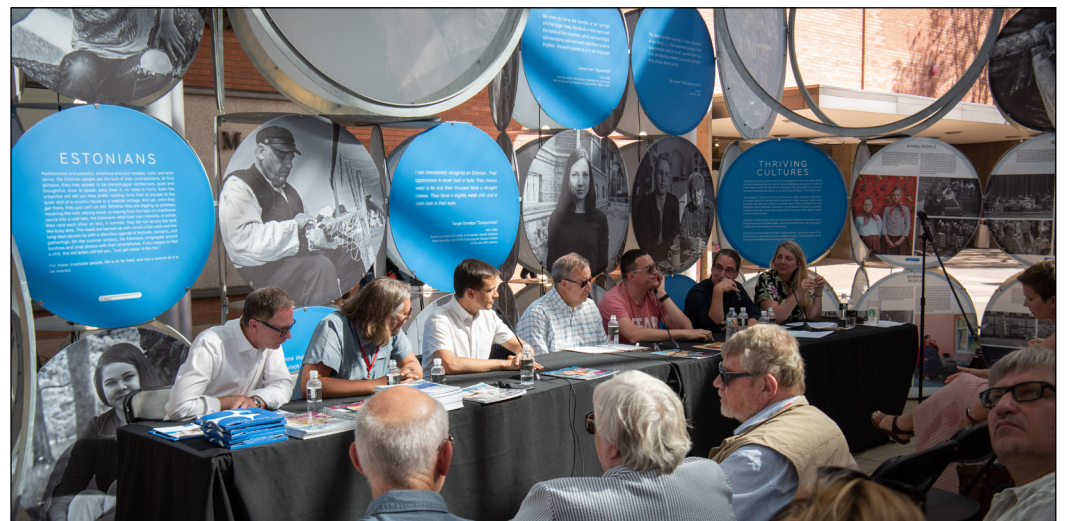
Panelists open "Masters of Our Own Homes: Estonia at 100" exhibit, a collaboration between Stanford Libraries and the Estonian Museum of Occupations