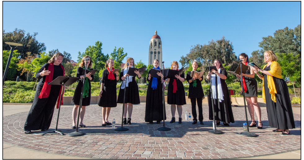
The Mägi Ensemble performs at an evening reception.

During the conference, two major Baltic exhibits were displayed on the Stanford University campus. "The Baltic Way: History and Culture in Estonia, Latvia, and Lithuania 1918–2018," on display in Cecil H. Green Library, drew on materials in the Stanford Libraries and Hoover Institution Library and Archives collections to explain the complicated history of Estonia, Latvia, and Lithuania in the 20th century and to consider their prospects and challenges in the 21st. A large traveling exhibit produced by the Estonian Museum of Occupations, "Masters of Our Own Homes: Estonia at 100," was set up in the