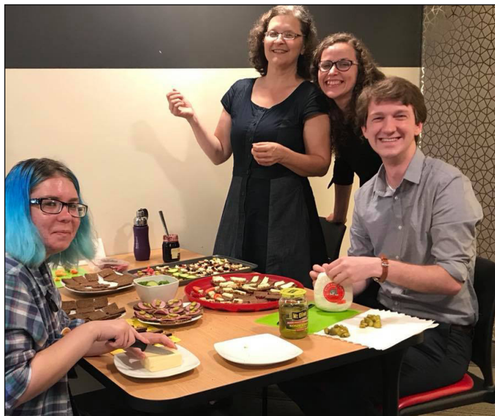
BALSSI students making Baltic sandwiches and getting ready for a cultural showcase, July 5, 2018.

To see more about the recent BALSSI courses and to be part of the network, visit our Facebook page @BalticStudiesSLI