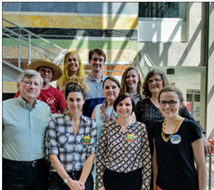
BALSSI students and instructors.

We were also happy to provide students with several opportunities to enjoy Baltic culture and languages in relaxed and immersive settings. Some of our students participated in the Indianapolis