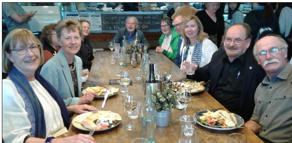
Participants of the AABS Australasian Chapter 19th conference at a collegial dinner.