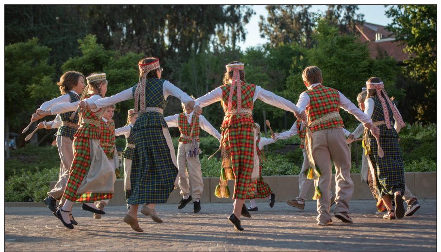
Lithuanian folk dancers from the group Tiltas perform at the Open-Air Celebration of Baltic Culture and Reception during the AABS conference at Stanford University.