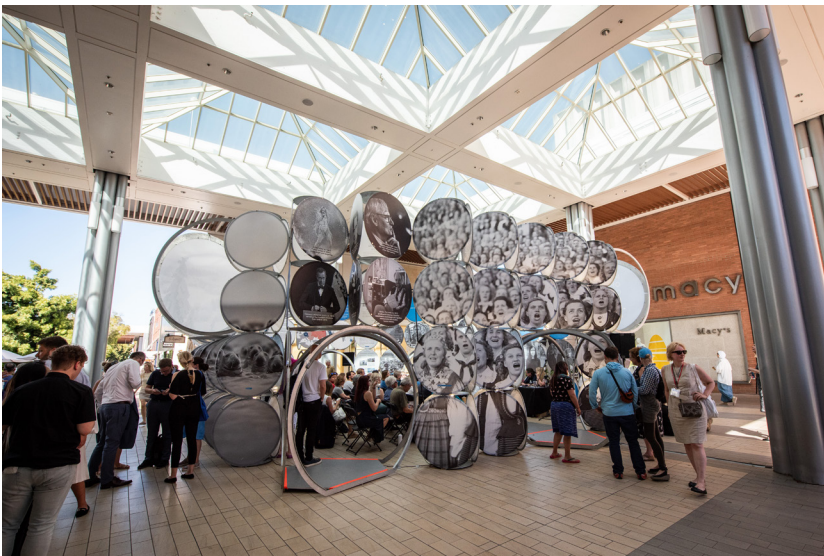
Top right: “Masters of Our Own Homes: Estonia at 100” exhibit